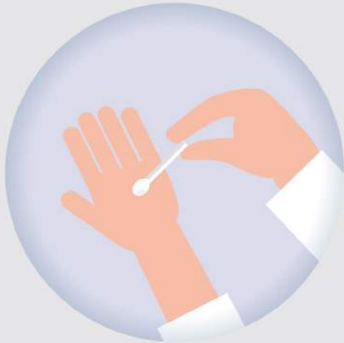
To take a sample on the spot