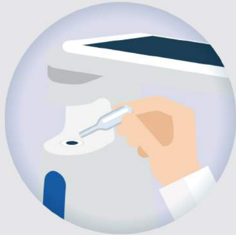
To check with mil-kin